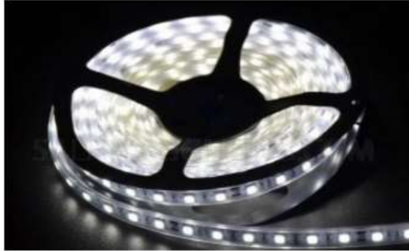
LED & LIGHTING