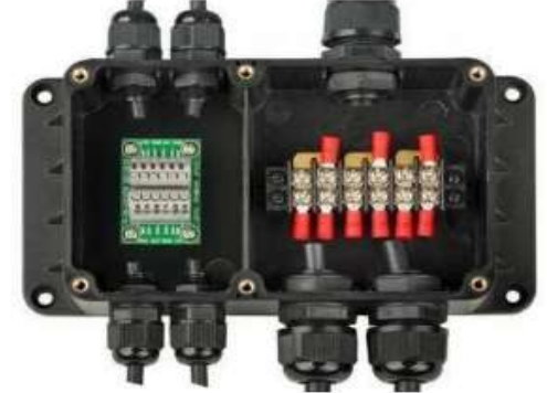
CABLE & CONNECTORS ENCLOSURES