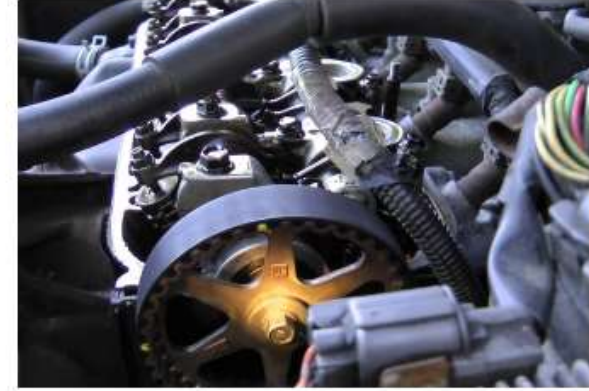
BEARING AND LINER GUIDES