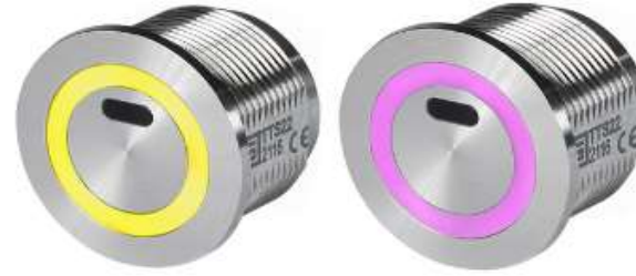
SWITCHES AND RELAYS