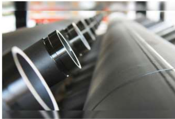
PIPES, TUBES , FITTINGS