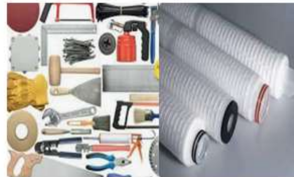
CONSUMABLES & CATRIDGE FILTERS