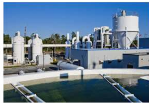
WATER TREATMENT CHEMICALS