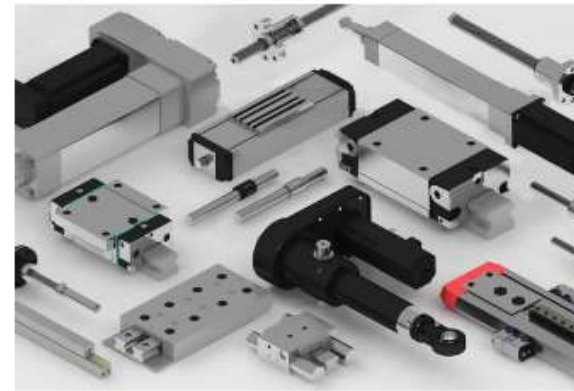
STANDARD MECHANICAL COMPONENTS