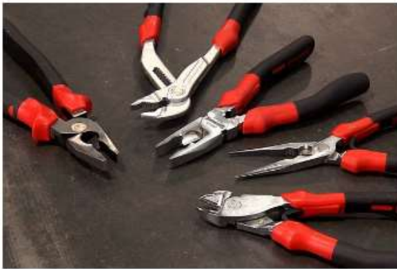
HAND TOOLS AND POWER TOOLS